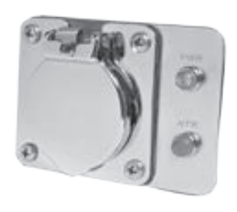
Dual Indicator Light