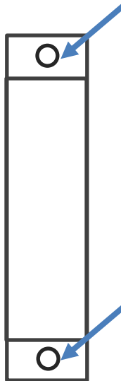
Figure 2-1 Mounting Bracket Screw Hole Locations (2)