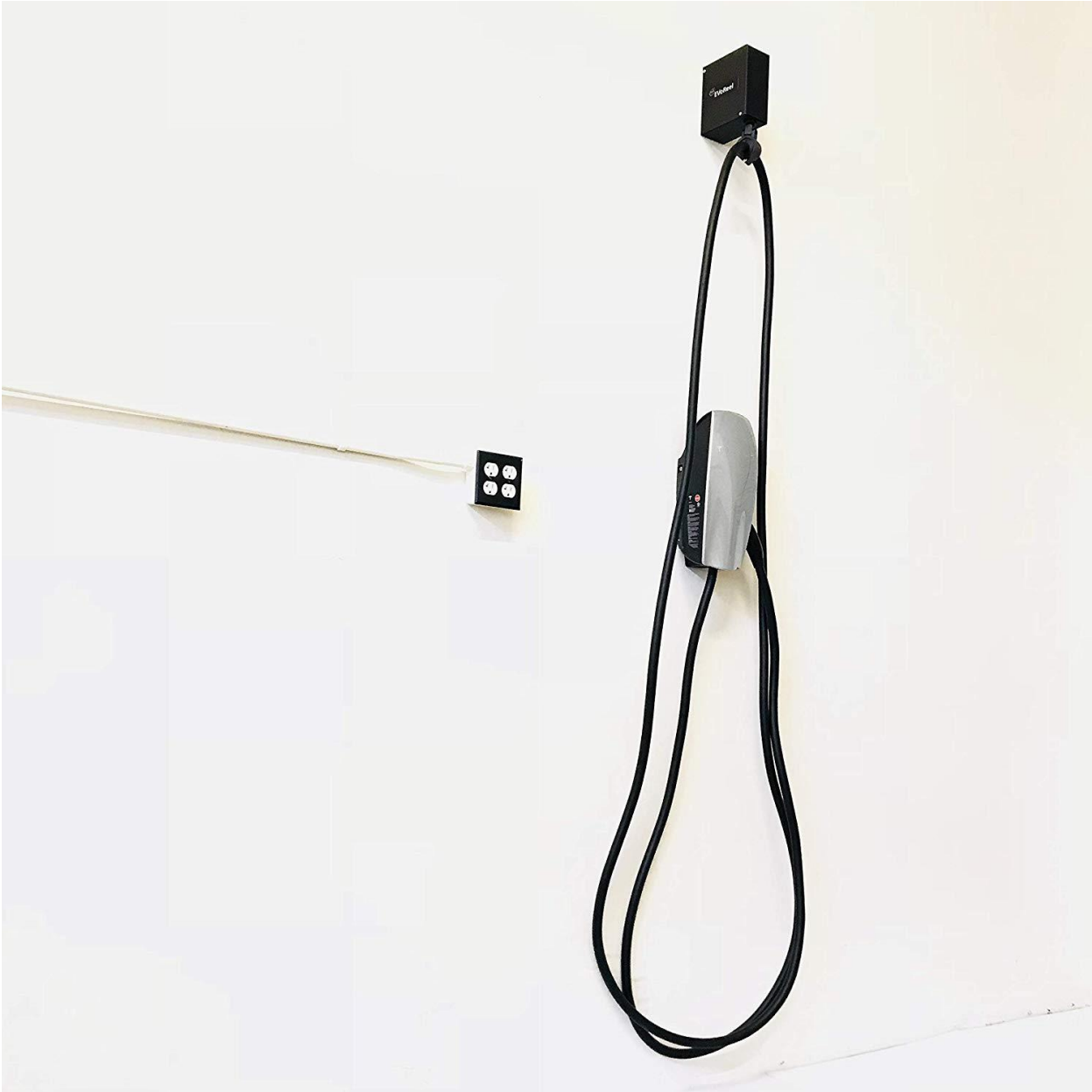
Figure 2-4 Example of installed product